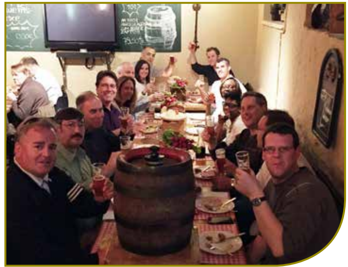
Committee members enjoying a meal together after a hard day's work