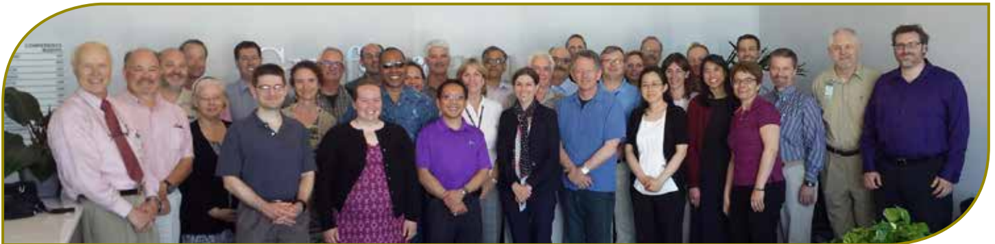
SC-233 members at Gulfstream Aerospace

The next meeting is scheduled for the fall of 2015 at RTCA, with the date to be determined. ■