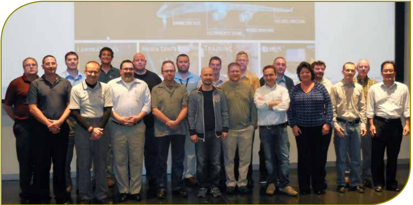
Committee members at the Wichita State University National Institute for Aviation Research training facility in Wichita, KS

The Committee is targeting a completion date for DO-160H/ED-14H by December 2019 and scheduling its next meeting for October 27-29 at RTCA. ■