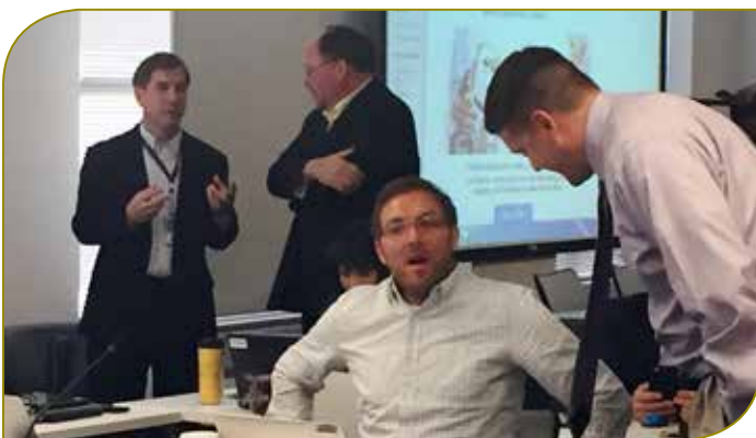
Member discussions during a break