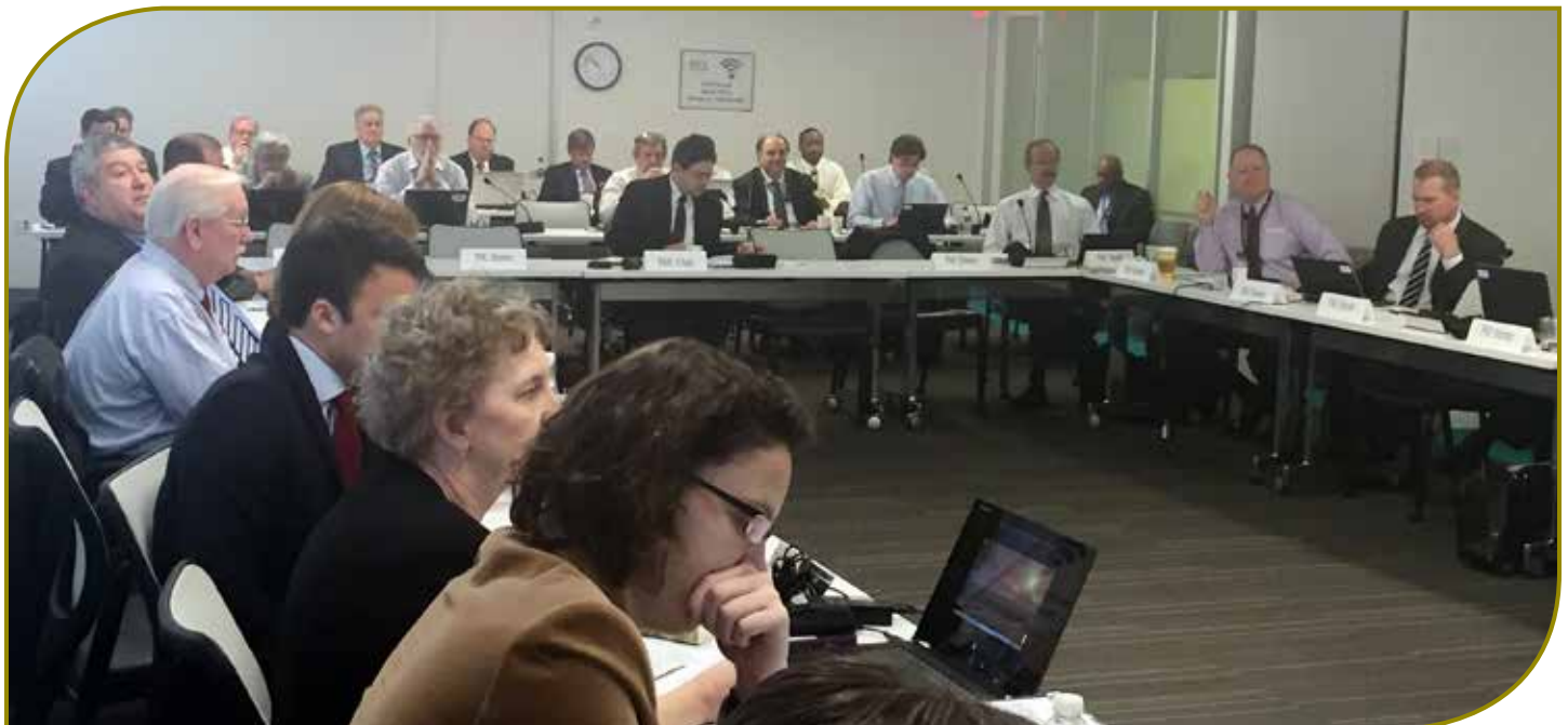
PMC members review revisions to Committee Terms of References

For additional information on this meeting and the upcoming June 18th meeting, visit www.rtca.org . ■