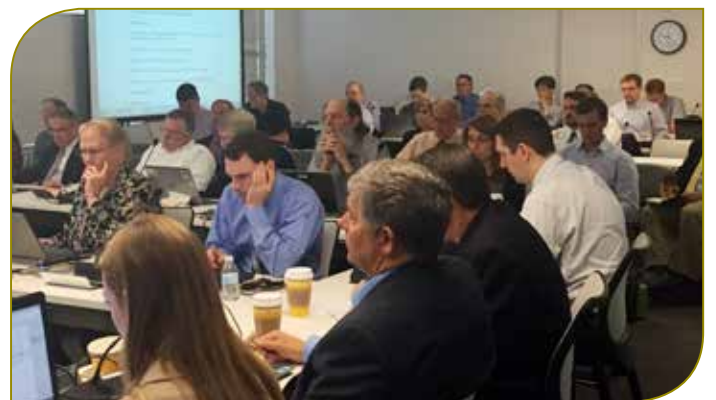
Committee Plenary in session