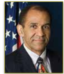
AWARDS LUNCHEON KEYNOTE SPEAKER

Michael Huerta Administrator, Federal Aviation Administration