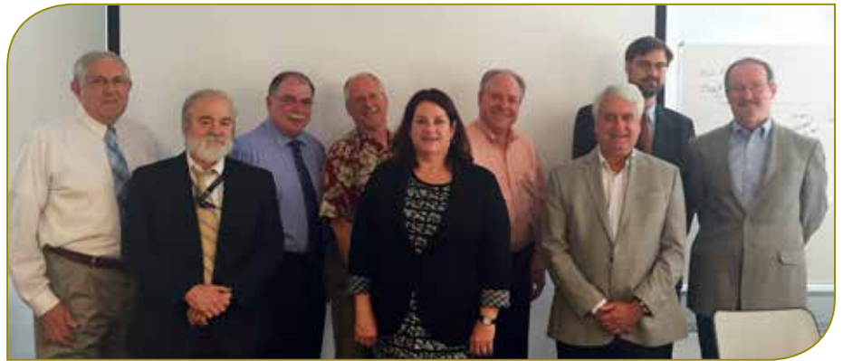
Committee and Working Group Leaders