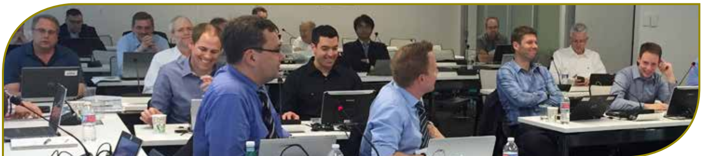
Committee members enjoying the conversation during their first Plenary