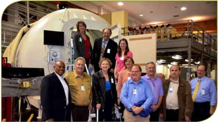
SC-206 visiting the NASA Langley Research facilities