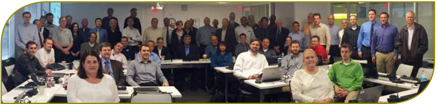
Working Group 1: Detect and Avoid