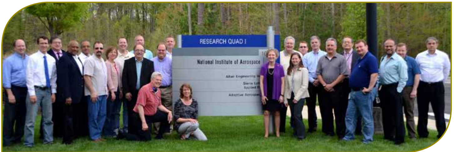
Committee members outside the National Institute of Aerospace in Hampton, VA

The next meeting is scheduled for September 14-18 in Chicago. ■