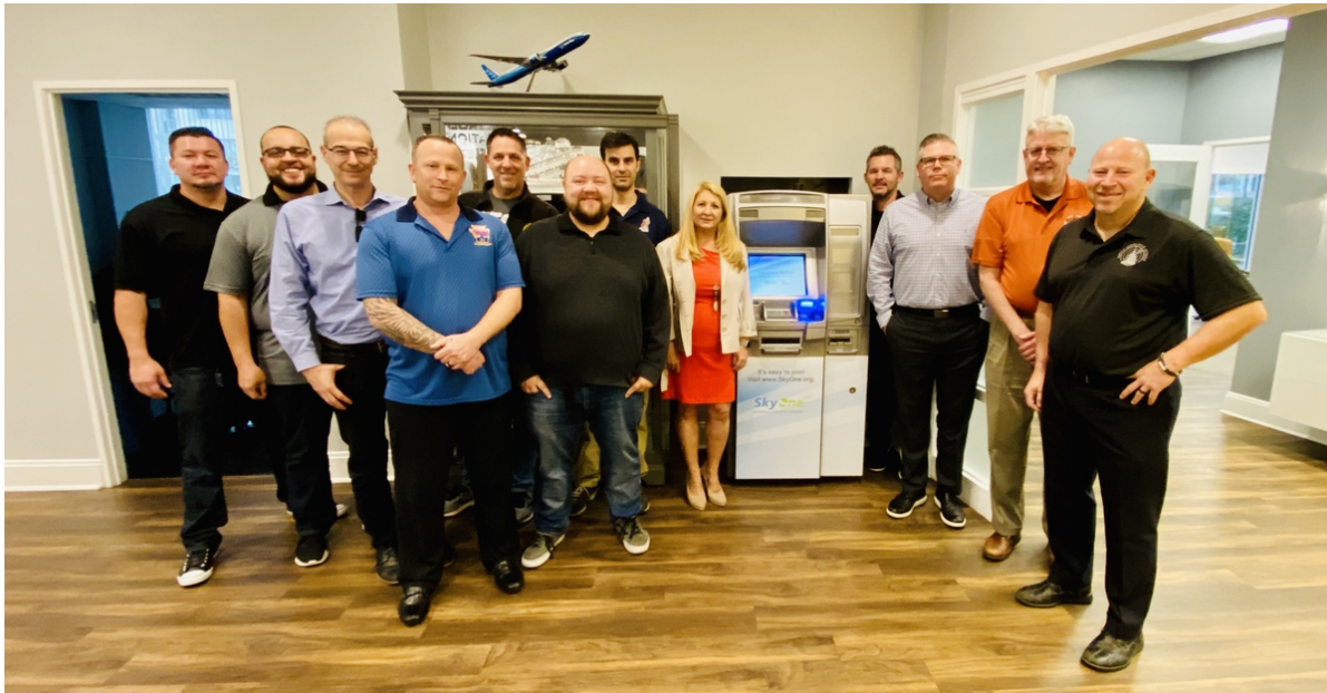
The NATCA National Executive Board in front of the SkyOne ATM in the NATCA National Office.

For more information, please visit the NATCA benefits website to take advantage of these great members-only savings.