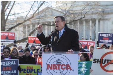
Senator Mark Warner (Va.)

Hundreds of NATCA members and their families gathered in Washington, D.C., to rally on Capitol Hill, calling for Congress to act and end the shutdown. Joining NATCA at the rally were numerous members of Congress and representatives from throughout the aviation industry. The event was covered extensively by all the national news networks, political media, and other media based in Washington.