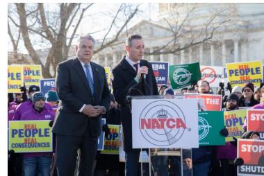
Congressman Peter King (N.Y.) and Congressman Brian Fitzpatrick (Pa.)