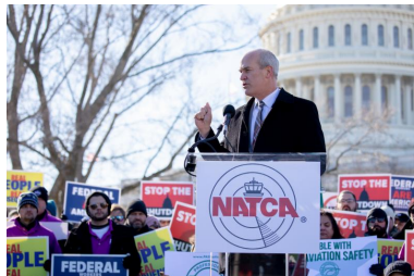
Congressman Rick Larsen (Wash.), Chair of Aviation Subcommittee of the U.S. House Committee on Transportation and Infrastructure