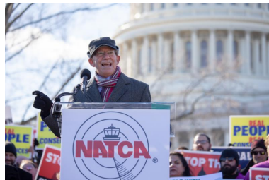
Congressman Peter DeFazio (Ore.), Chair of U.S. House Committee on Transportation and Infrastructure