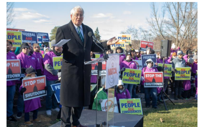
Congressman David Price (N.C.), Chairman, House Transportation, Housing, and Urban Development Appropriations Subcommittee