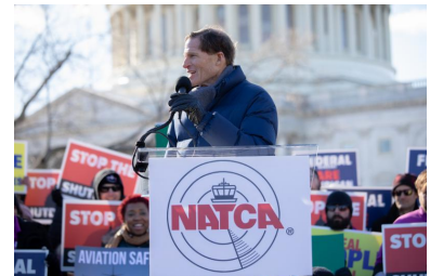
Senator Richard Blumenthal (Conn.)