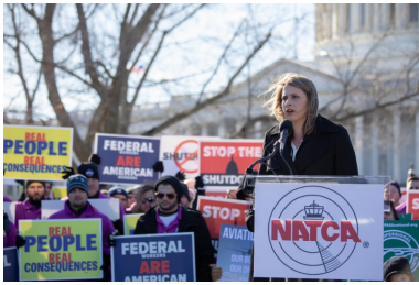
Congresswoman Katie Hill (Calif.)