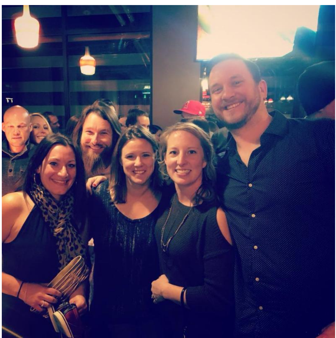
Colorado's NATCA members gathered for their annual holiday party

The festivities took place at the Punch Bowl Social in Denver, located in the old Stapleton ATC Tower/TRACON. Members and their guests raised more than $250 for the NATCA Disaster Relief Fund, while celebrating another year of solidarity with bowling, ping pong, and karaoke.