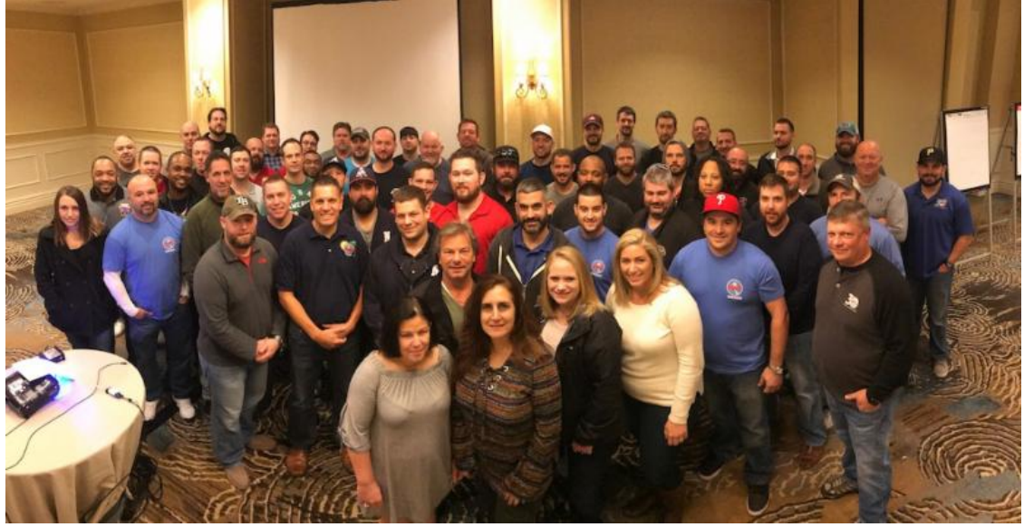
Fire in Their Bellies

NATCA Southern leaders gather for regional meeting. Read more.