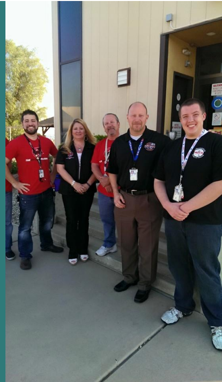
At Bakersfield (BFL)