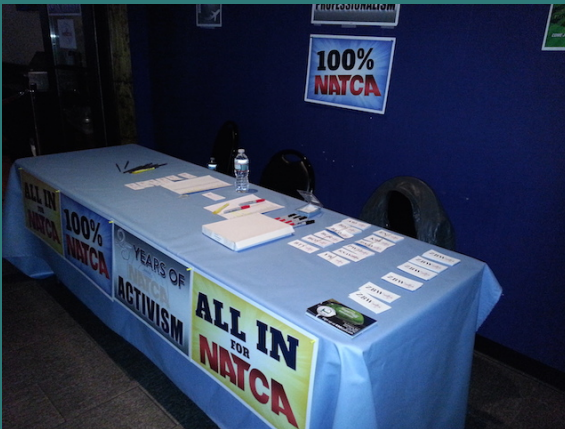
NE Spring Fling

Sorry we missed the NE Spring Fling this year. Great work there and in SAT promoting NATCA's legislative efforts!!!