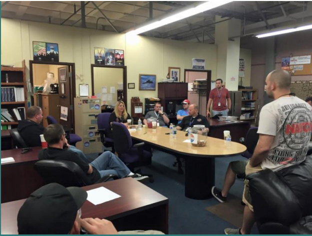
ZLA NATCA member's office