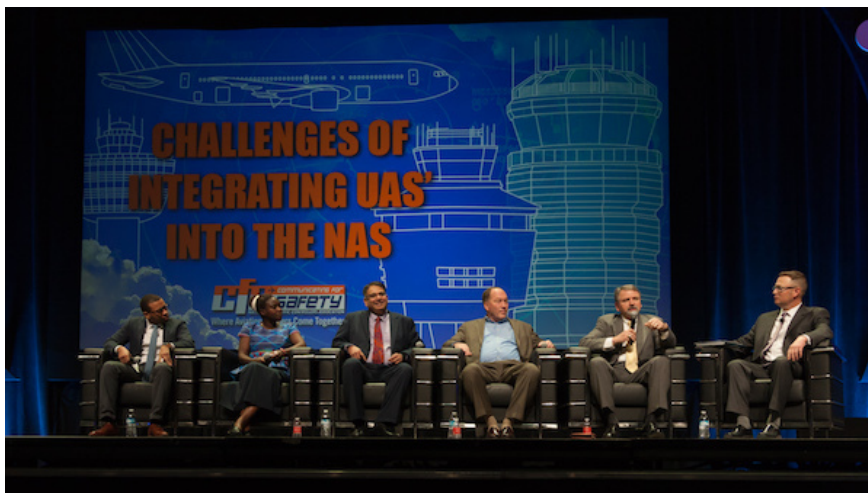
Challenges of Integrating UAS into the NAS