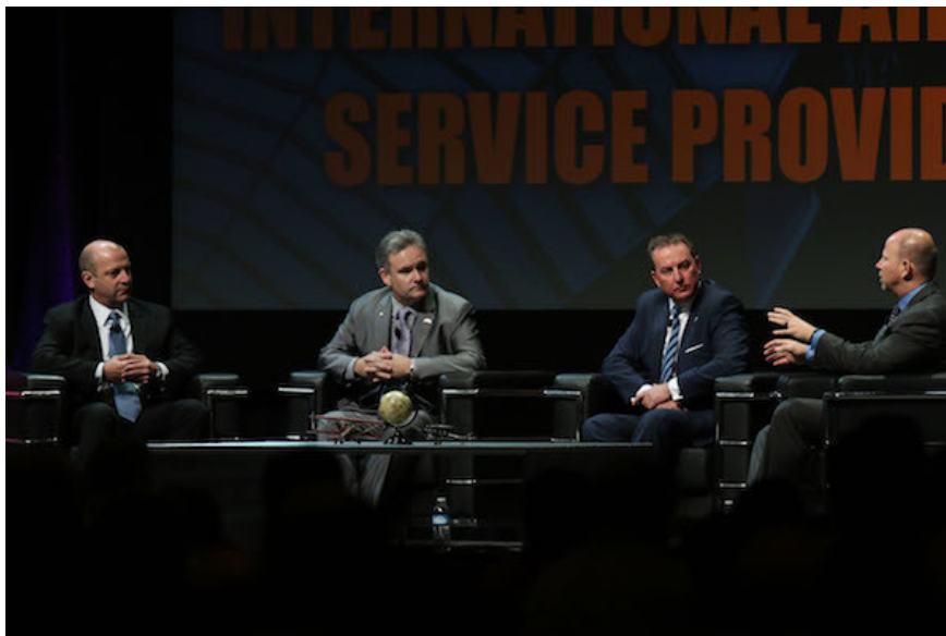
International Air Navigation Service Providers (ANSP) Discussion