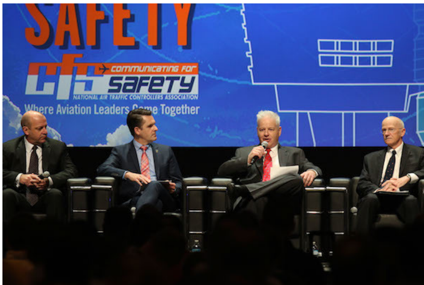
Remote Tower Systems