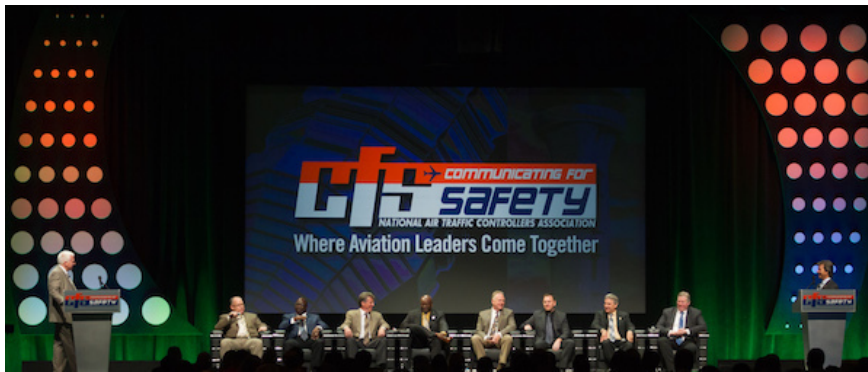
Improving Safety Through Collaboration