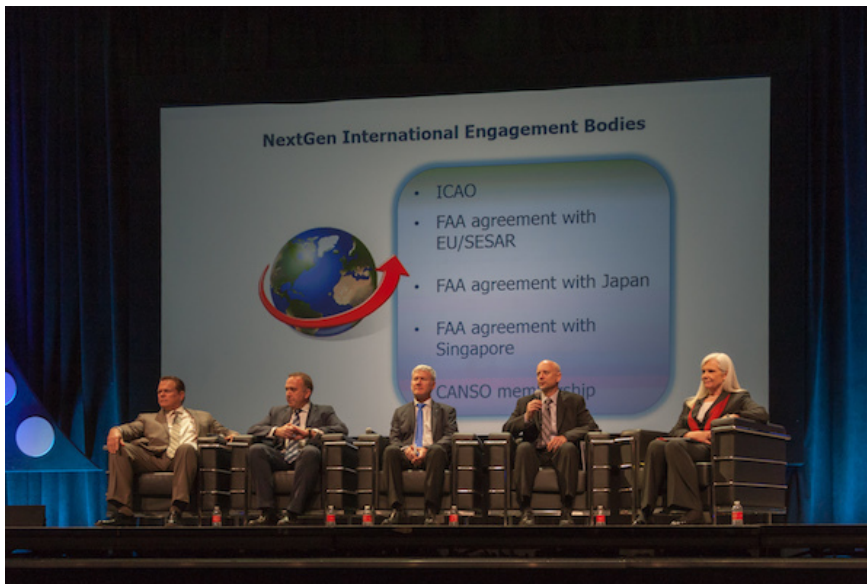
NextGen and SESAR