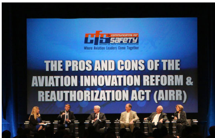
The Pros and Cons of the Aviation Innovation Reform and Reauthorization Act (AIRR)