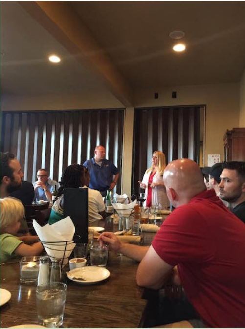
NCT and SMF