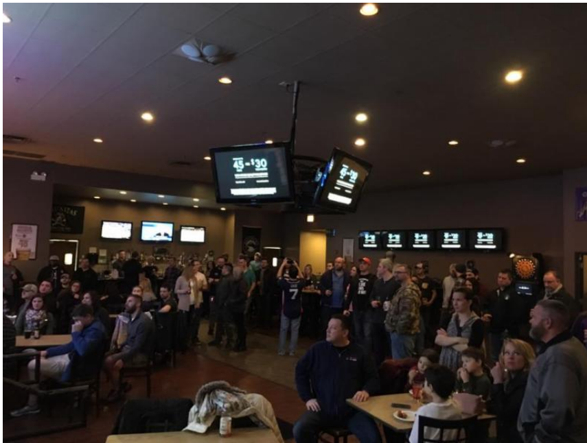
Chicago area event