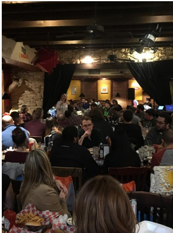
OKC Academy students in initial training