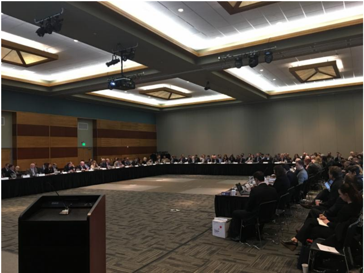
Drone Advisory Committee

While there she joined members from RNO for dinner and gave them a briefing on the hiring issues and potential legislation.