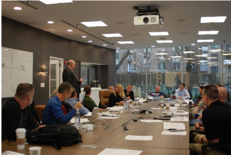
Committee chair meeting

On Feb 2 and 3 the national committee chairs were in DC for their annual training and briefings.