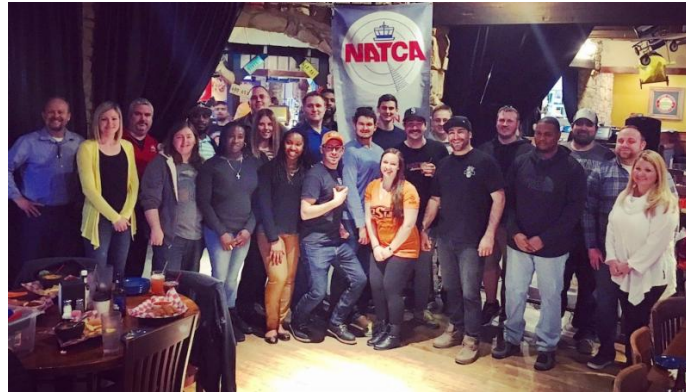
NATCA in OKC for Training (RTF and other)