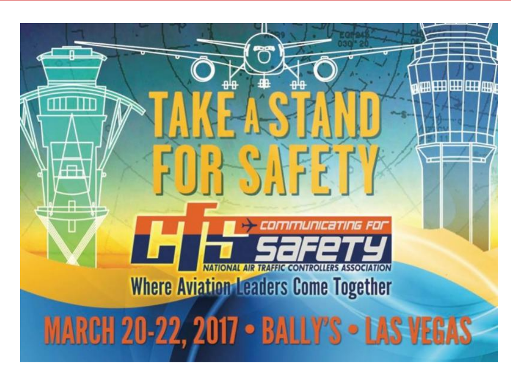
Registration for Communicating For Safety 2017 is Open

For the Union Plus scholarship page, simply click <u>here</u> and follow the links. (Deadline to apply: Jan. 31)