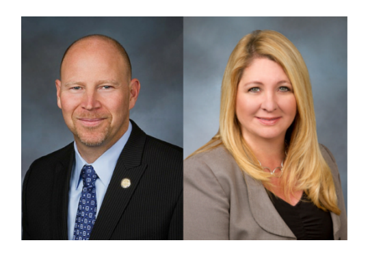
Executive Order on Hiring Freeze