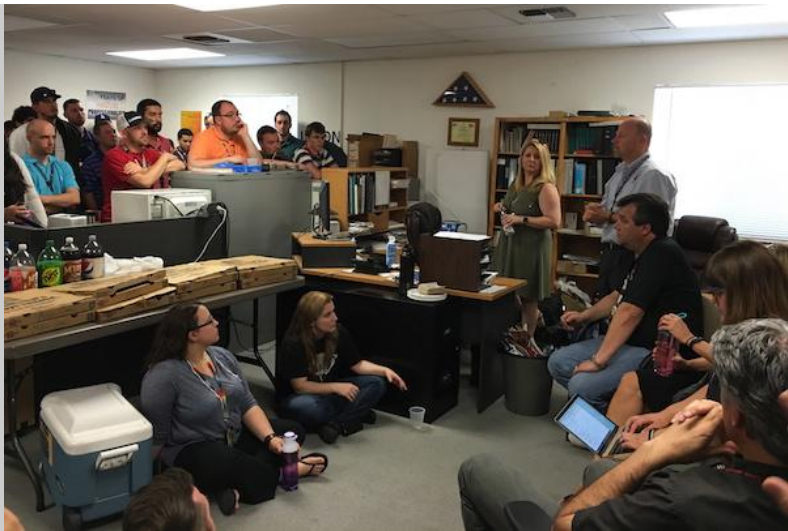
ZOA local membership meeting