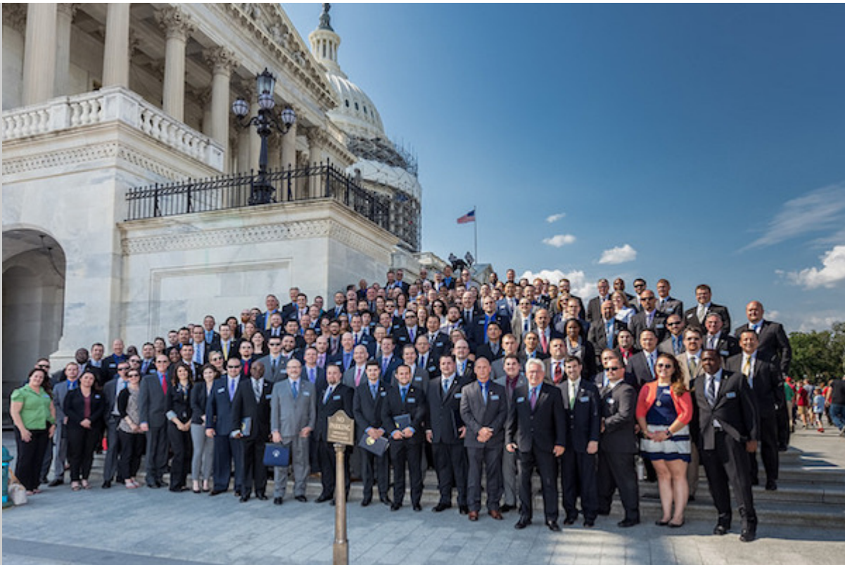
Group photo 2016 NATCA In Washington