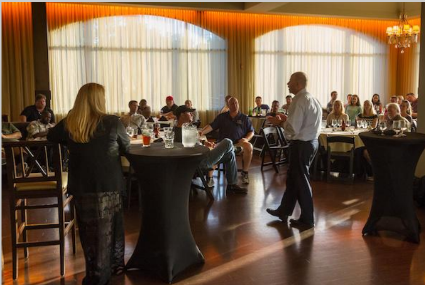
Atlanta area member meeting