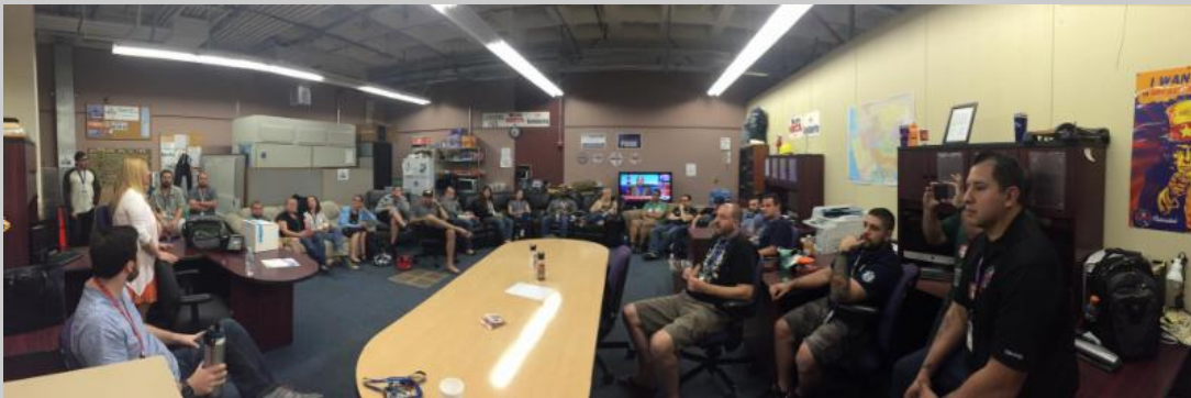
ZLA local membership meeting