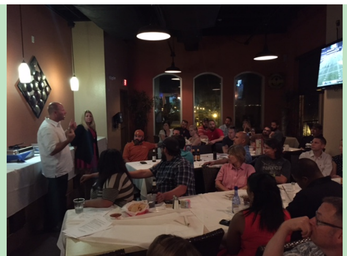
CRP meeting attended by CRP, DAL, LBB, SAT, AUS and BPT members.