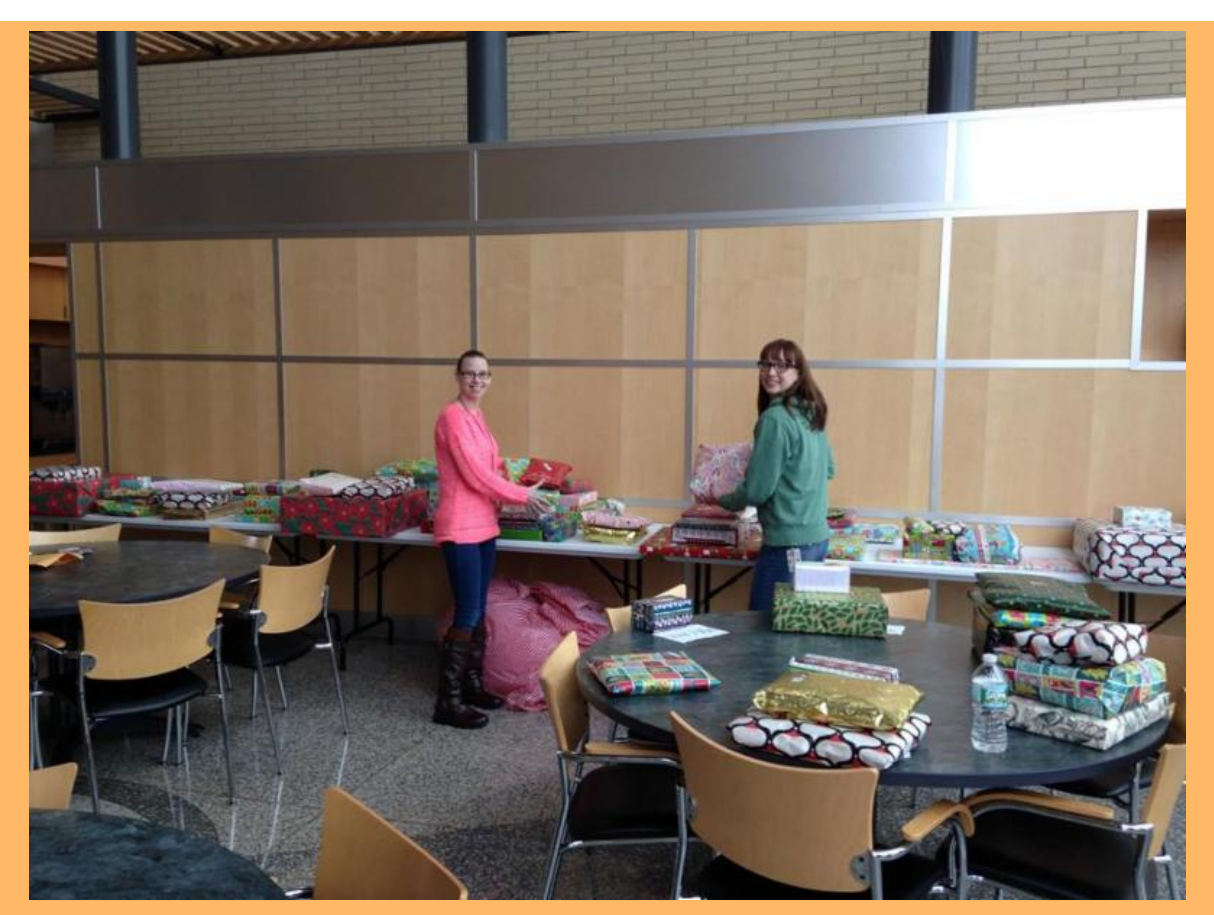
Follow the OUATCA Charitable Foundation on Facebook