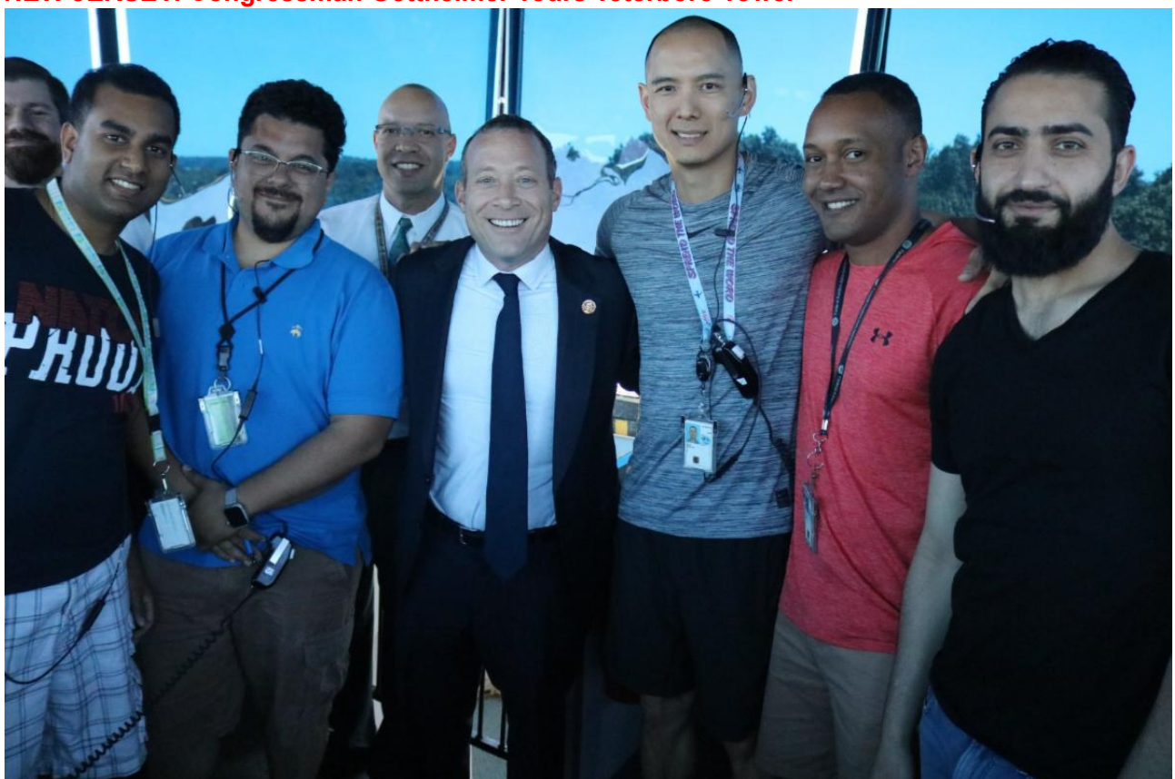
NEW JERSEY: Congressman Gottheimer Tours Teterboro Tower