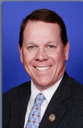
Congressman Sam Graves (MO-06)