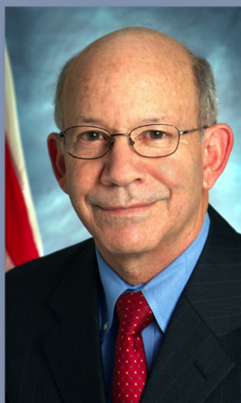
Congressman Peter DeFazio (OR-04)