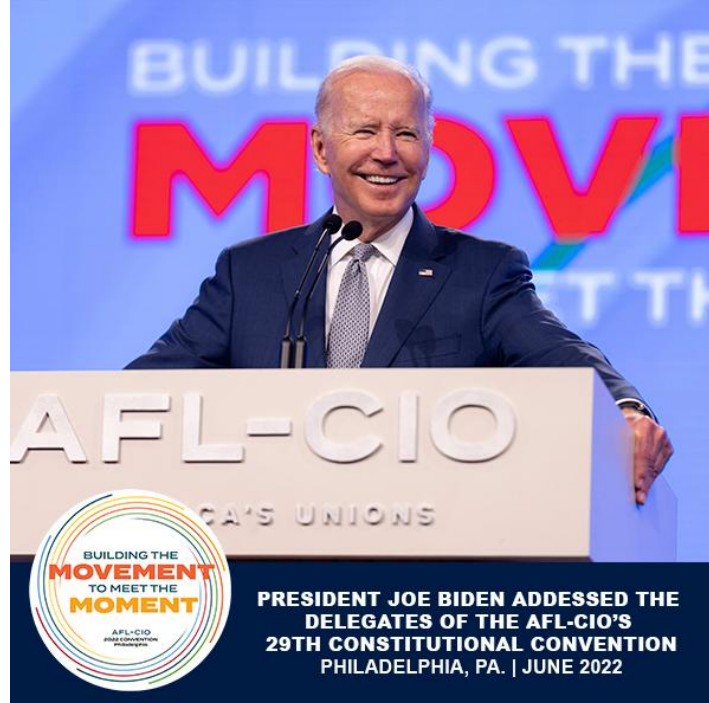
PHOTO: President Joe Biden

Pro Act, which would strengthen the right to organize in the private sector, including the Federal Contract Tower program, and provide more teeth to the penalties for unfair labor practices committed by employers. He also addressed building the economy from the middle out, inflation, touted his successes including the American Rescue Plan, which protected Americans and their paychecks during the pandemic, and the bipartisan infrastructure law, specifically mentioning the money set aside for improvement at airports this year, something NATCA worked very hard to achieve. You can watch President Biden's full speech here .