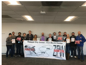
NATCA Members across the country waiting to welcome the Gold Star families