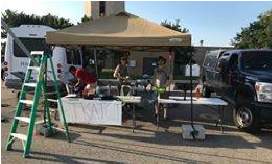
PTK ATCT members' makeshift working conditions outside due to mold in their control tower.

Pontiac ATCT (PTK) currently has seven CPCs and five trainees. They are a level six VFR tower that is a Class D, operating underneath Detroit TRACON's (D21) airspace. PTK works primarily general aviation with a broad mixture of pilots. There are seven flight schools on the field and over 20 fixed-based operators (FBOs) so they deal with anything from student pilots in the pattern to business jets, traveling all over the country.