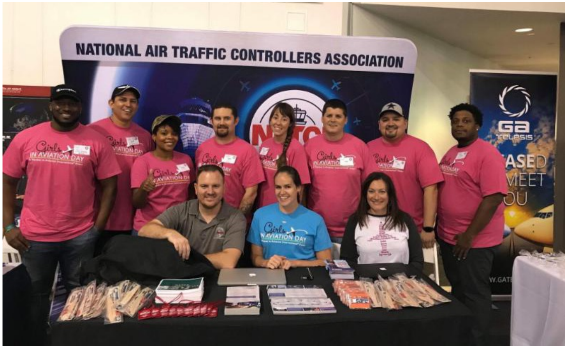
Local controllers manning the NATCA table at the Dallas GIAD, ready to tell students about aviation.