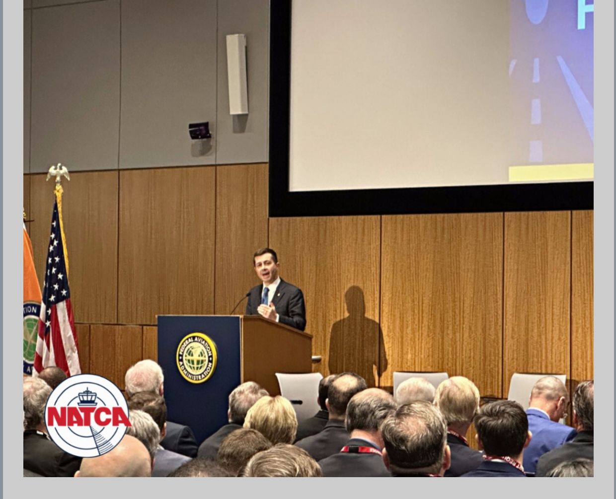
PHOTO: Secretary of Transportation Pete Buttigieg kicked off the FAA Safety Summit. During his opening remarks, he said, "Initial information suggests that more mistakes than usual are happening across the system— on runways, at gates when planes are pushing back, in control towers, and on flight decks. Today is about the entire system. This is a key priority for the FAA and for the entire Department of Transportation."