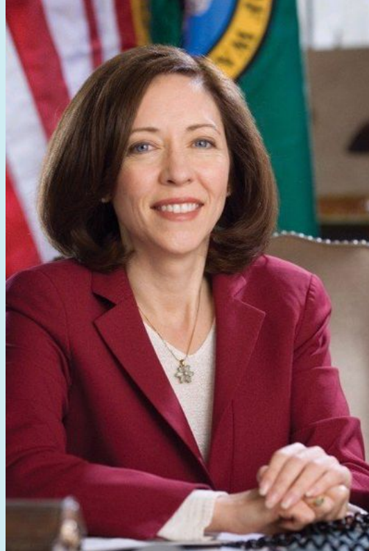
PHOTO: Sen. Maria Cantwell