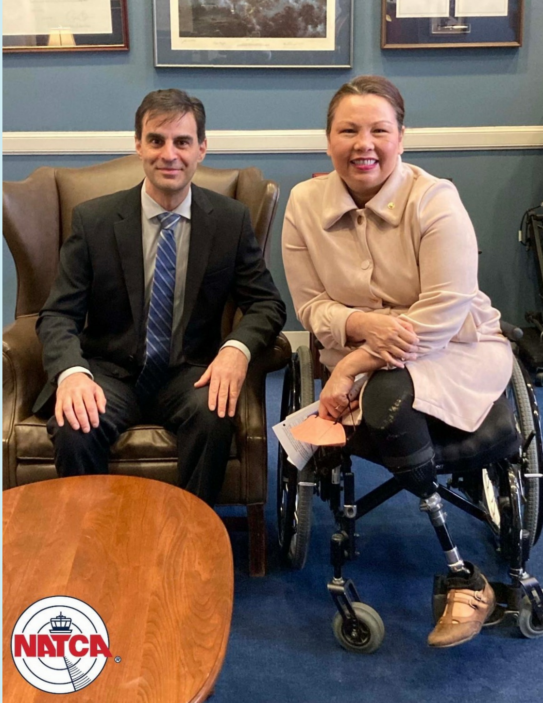
PHOTO: On Tuesday, Santa met with Senator Tammy Duckworth (Illinois), who is the Chair of the Subcommittee on Aviation Safety, Operations, and Innovation of the U.S. Senate Committee on Commerce, Science, and Transportation.