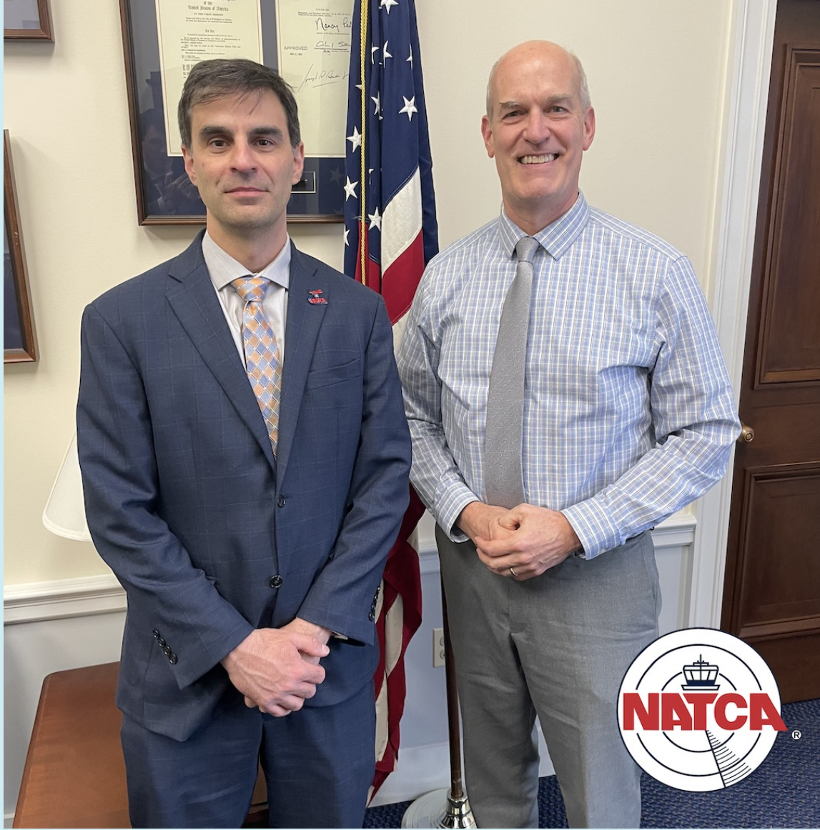
PHOTO: On Thursday, Santa met with Rep. Rick Larsen (Wash.-2nd District), who is the ranking member of the House Transportation & Infrastructure Committee.