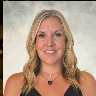
Jade Hetes Albuquerque Center